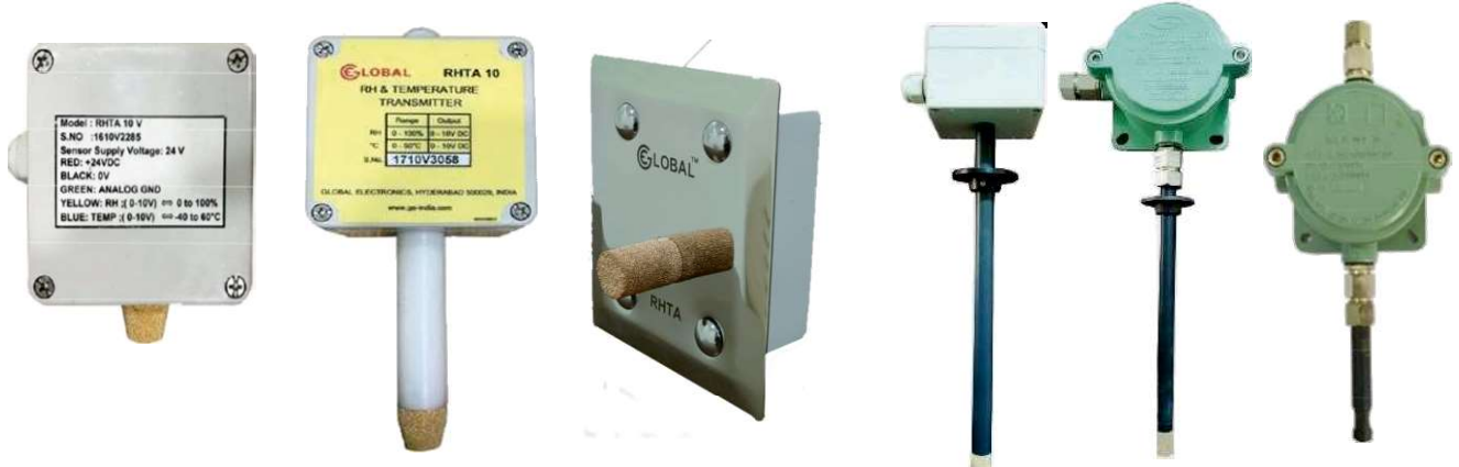
Duct Mount Flameproof