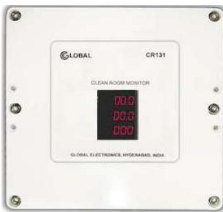
CR 131 Flameproof